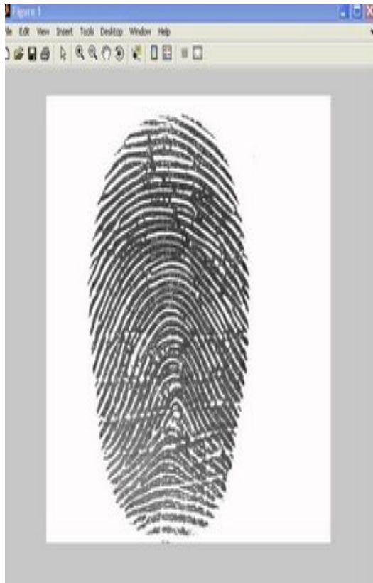
Fig.2 Input Iris Image

images and one noise-like share is used. The selected natural images are digital color image. One is the digital image with the size of 1024 \times 768 pixels and other is the printed image with the size of 600 \times 450 pixels. These natural shares are resized to the size of 256 \times 256 pixels as shown in fig (2) and fig (3).