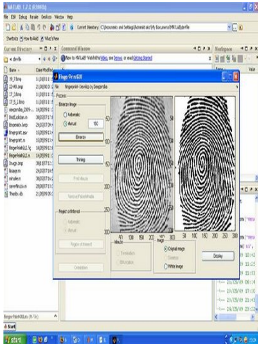
Fig 4 Overall Process Diagram

Using the selected natural shares and the generated noise-like share the secret image is recovered. The recovered image is shown in fig (6).