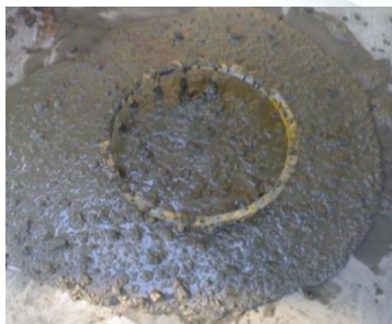
(d) J-ring test