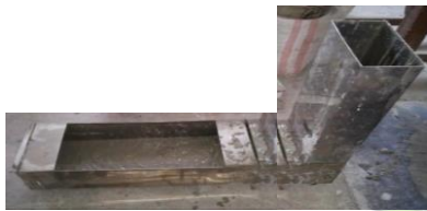
(b) L-Box test