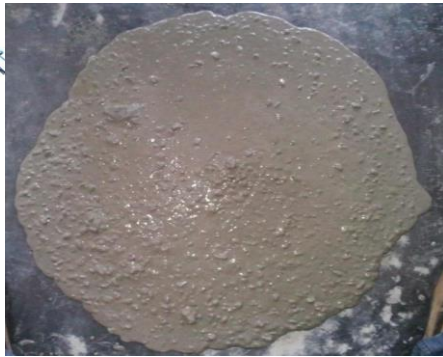
(a) Slump flow test