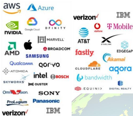
Fig. 5. Infrastructure of metaverse