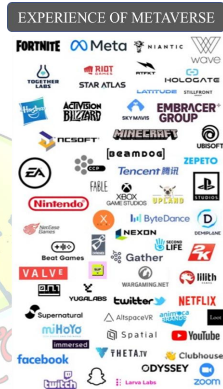
Fig. 1. Experience of metaverse

immersion inside a story-world or a graphical space, but also to the social immersion and the way it sparks interaction and also drives content [10].