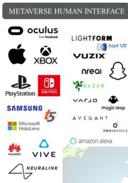
Fig. 7. Metaverse human interface