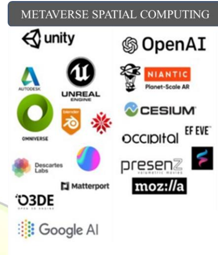
Fig. 4. Metaverse spatial computing