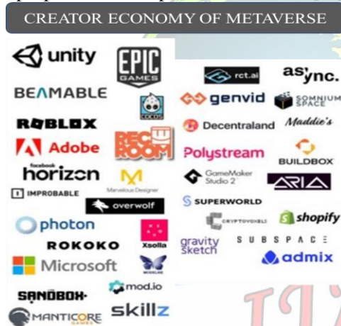
Fig. 2. Creator economy of metaverse

well as marketplaces of content that refocus development from within a bottoms-up, the code-centered process for a top to bottom, innovatively centered process. At present, it is possible to start an e-commerce website in a few minutes without knowledge of a single line of code. Websites can be built and managed. 3Dimensional graphics experience may be created within game engines without touching the lower tier rendering Application programming interface utilizing visual interfaces in their respective studio environments. In the metaverse, experiences will increasingly be social, live, and constantly updated. So far, creator-driven experiences from the metaverse have largely been centered around centrally controlled platforms. With its comprehensive set of built-in tools, social networking, discovery, and monetization features, it has enabled an unprecedented number of people to create experiences for others [10].