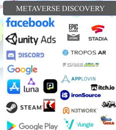
Fig. 3. Metaverse discovery