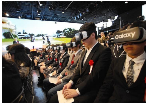
Figure 1-Virtual ceremony held by N High School in Tokyo