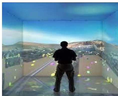
Figure 4- Cave Automatic Virtual Environment Model (CAVE)