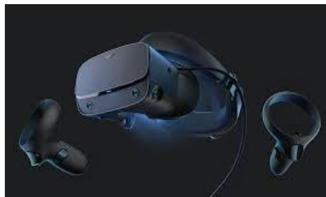
Figure 3- Oculus Rift