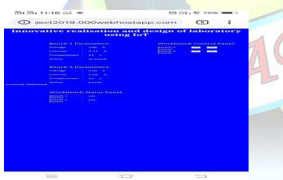
Fig.4 IOT Page for Monitoring

The above fig 6.10 shows that Iot page value for the monitoring systems in the workbench through this we can control the bench and monitored it from anywhere in the world. We can individually on and off the work bench through this IoT to avoid the using of lab unwontedly. So we can go anywhere while the students are doing an experiment and we can monitor them through the IoT page.