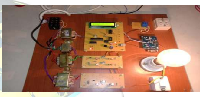
Fig.3 Entire Circuit Connection

works along the same principle of other transformers. It of powering the electronics within the circuit breaker trip unit and sensing the circuit current within the protected circuit This is the entire view of the project where we can monitor the voltage, current, and temperature and we can also detect the each fault in the work bench. It is monitored using IoT and individually we can control the workbenches through IoT in each workbench this system has to be implemented to avoid the damage and also for the safety.