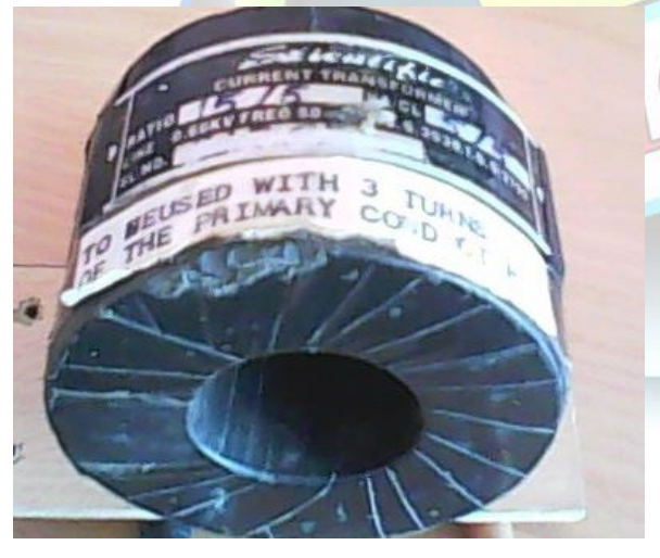
Fig. 2 Current Transformer

A current transformer is a device for measuring a current flowing through a power system and inputting the measured current to a protective relay system. Electrical power distribution systems may require the use of a variety