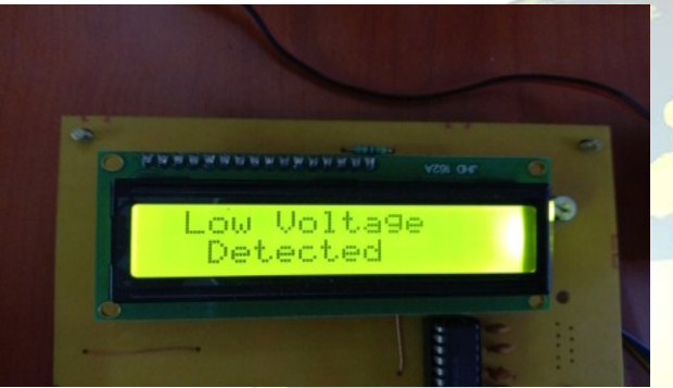
Fig.4 Low Voltage Detected