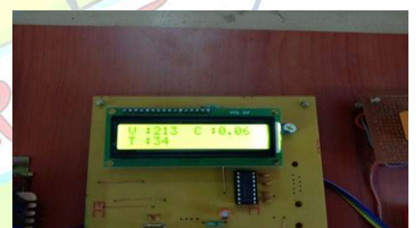
Fig.4 Status of workbench

The above fig shows that IoT page value for the monitoring systems in the workbench through this we can control the bench and monitored it from anywhere in the world. We can individually on and off the work bench through this IoT to avoid the using of lab unwontedly. So we can go anywhere while the students are doing an experiment and we can monitor them through the IoT page.