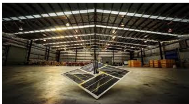
Fig.2: Renewable power source - Solar panels

The electronics of each unit are powered by an array of solar panels conveniently placed between the envelope and the hardware. In full sun these panels produce a power of 100W (Watt) that is sufficient to keep the unit running and also for charging the battery for use at night.