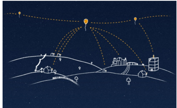
Fig.6: Transmission of signals

Once the trifecta of balloon, antenna and local ISP is complete, each balloon is theoretically capable of bringing internet connectivity for everyone in a 12 mile radius. The radios and antennas are designed such that it can send and receive signals from project loon only. The users send signals by the stationary antenna attached to their building. The top of the balloon envelope consists of a reflector disc and a pair of patch antenna kept parallel. The signals from the user are reflected to the patch antenna. Simultaneously, it also receives direct waves. These two waves interfere constructively only for the correct wavelength that are to be received. The received signals bounce from balloon to balloon and finally reaches the ground station which are spaced about 100 km (62 mi) apart and joins the global network with pre-existing internet infrastructure, like our local telecommunications partners. This is cost effective compared to satellite communication, where the service cost exceeds the monthly income of a common man. The developing country that cannot afford to lay fibre cables is greatly benefited.