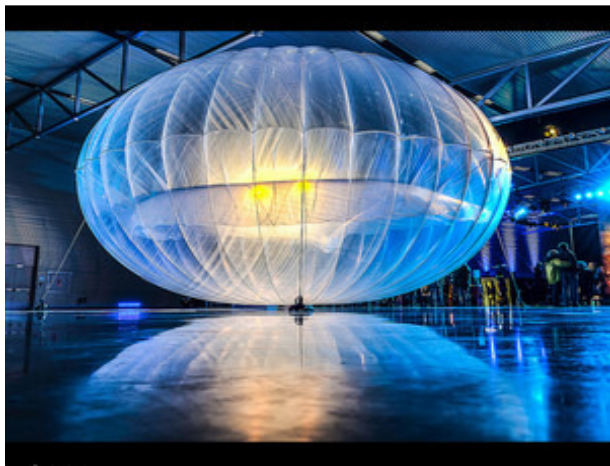
Fig.1: Fully inflated balloon envelope

The inflatable part of balloon made of sheets of polyethylene plastics, which is of about 3 mil or 0.076 mm thickness. It forms the balloon envelope. These balloons are filled with Helium and stands 15m (49ft) wide and 12m (39ft) tall when fully inflated for a height. They are long-lasting than normal weather balloons and withstand the high pressure from the air inside as the balloon when it reaches the high float altitude. These are super pressure balloons and have a maximum life of 55 days. When a balloon is to be taken out of service, gas is released in a periodic manner for controlled descent. This is implemented with the help of a custom air pump system, which used to pump in or release air from the balloon. Unfortunately, if a balloon drops quickly or when it is to be taken out of service safely, we deploy a parachute attached to the top of the envelope.