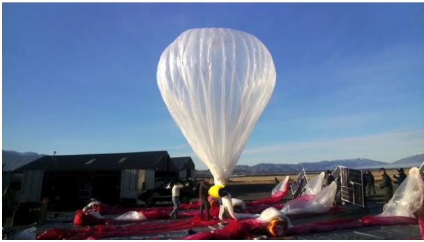
Fig.7: Pilot test in New Zealand

They offered 18 minutes of balloon based internet for 60 lucky volunteers on 40th parallel south. Initially 40 balloons were launched. The results of these tests are being used in the refinement of technology and the feedback is also used for the betterment of next phase of testing. National Space Research Institute of Brazil(INPE) ran a test in São Paulo state. It yielded a positive response. The balloon was able to broad cast an Omni-directional internet signal from 31 miles away. Google is trying to test all manners of materials subjecting them to durability, temperature resistance etc., Small private tests were conducted in California also. These tests are conducted with a motive to add more sophisticated technologies and to increase the balloons performance.