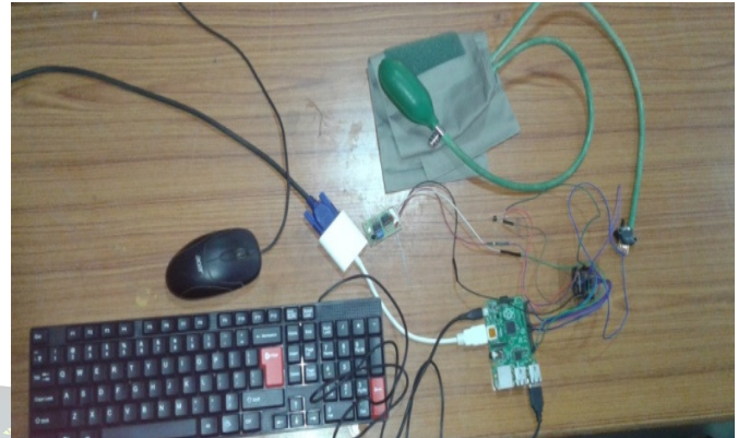
Fig 2. experimental setup

The three sensors are connected with the ADC in which the analog input values of temperature, blood pressure and heartbeat are converted into digital output values. The ADC (Analog to Digital Converter) is interfaced with the Raspberry Pi. The converted digital output values are passed into Raspberry Pi in which the values are automatically updated in the monitoring screen for every second. The values shown in the monitoring screen are sent to nearby hospitals through SMS or a Mail Alert using IOT. Here LED is used for communicating purposes in order to know whether there is an availability or not which is used in our project to save the precious time of a patient's life.