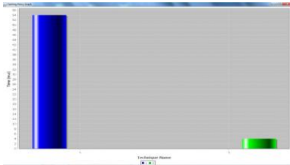
Figure2:caching policy graph

we evaluate the regular and effective histograms. Histograms may be used to approximate records values, as we've illustrated. In relational databases, histograms are used to capture characteristic fee distribution and provide selectivity estimation for the query optimizer. The sum squared errors metric has been designed to formulate the selectively estimation error of a histogram. However, this histogram metric does no longer always cause effective candidate pruning in our kNN search problem. In this paper, we endorse a appropriate histogram metric for kNN search, and construct a corresponding histogram with a view to boost up the refinement section in kNN search.