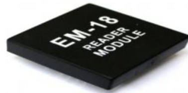
Fig.2: RFID Reader

Active Tags: These tags have integrated batteries for powering the chip. Active Tags are powered by batteries and either have to be recharged, have their batteries replaced or be disposed of when the batteries fail.