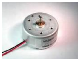
Fig: DC Motor

A DC motor relies on the fact that like magnet poles repels and unlike magnetic poles attracts each other. A coil of wire with a current running through it generates an electromagnetic field aligned with the center of the coil. By switching the current on or off in a coil its magnetic field can be switched on or off or by switching the direction of the current in the coil the direction of the generated magnetic field can be switched 180°.