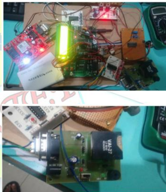
Fig: Kit overview