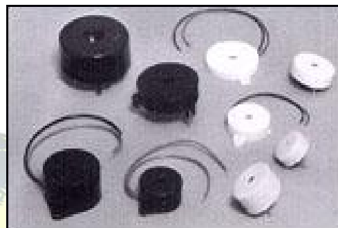
Fig:4: Types of Buzzers

equipment, audio equipment telephones, etc. And they are applied widely, for example, in alarms, speakers, telephone ringers, receivers, transmitters, beep sounds, etc.