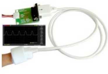
Fig: 3:pulse sensor

Attach to finger and get Analog out from the sensor based on heart beat pulse. You can read the analog output with microcontroller ADC and then plot it or calculate readings like heart beat per minute. It is simple to use and accurate results.