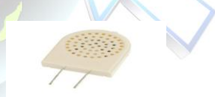
Fig:3: Humidity sensor

Humidity sensor is a device that measures the relative humidity of in a given area. A humidity sensor can be used in both indoors and outdoors. Humidity sensors are available in both analog and digital forms. An analog humidity sensor gauges the humidity of the air relatively using a capacitor-based system. The sensor is made out of a film usually made of either glass or ceramics. The insulator material which absorbs the water is made out of a polymer which takes in and releases water based on the relative humidity of the given area. This changes the level of charge in the capacitor of the on board electrical circuit. A digital humidity sensor works via two micro sensors that are calibrated to the relative humidity of the given area. These are then converted into the digital format via an analog to digital conversion process which is done by a chip located in the same circuit. A machine made electrode based system made out of polymer is what makes up the capacitance for the sensor. This protects the sensor from user front panel (interface).