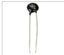
Fig: 2:Temperature sensor

A thermistor is a type of resistor whose resistance is dependent on temperature. Thermistors are widely used as inrush current limiter, temperature sensors (NTC type typically), self-resetting overcurrent protectors, and self-regulating heating elements. The TMP103 is a digital output temperature sensor in a four-ball wafer chip-scale package (WCSP). The TMP103 is capable of reading temperatures to a resolution of 1°C.