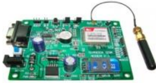
Fig: 6:GPRS module