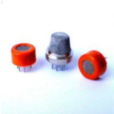
Fig: 4:Co2 sensor