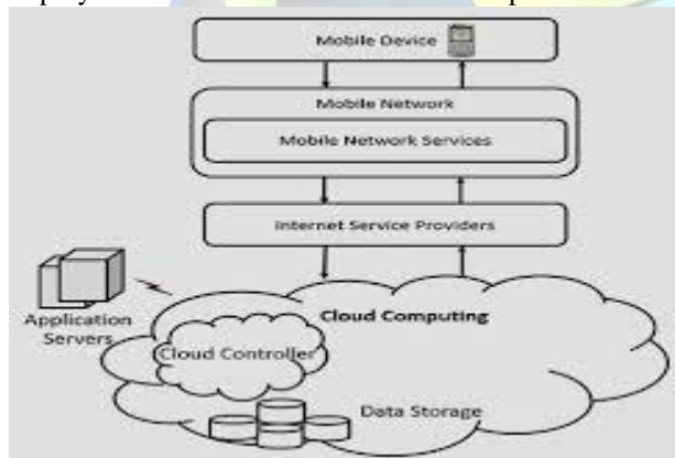
Figure 3 Mobile with cloud computing

Leveraging cloud computing solutions with Mobile IP is a great advantage for companies having their own computing abilities cutting out edge technology and providing scalability, reliability, empowerment of employees and some real time issues and updates.