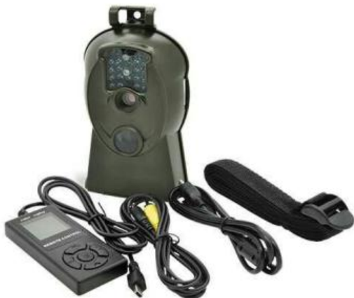
Fig -3: Motion detection camera

Motion detection is an important tool for securing your business or building. It alerts you when someone is on your property that isn't authorized. Understanding how this technology helps you set up better motion detection regions and alerts, but do you actually know how motion detection works? To understand motion detection, you first need to understand how a camera works. Inside the camera is an image sensor, which the camera lens directs light to - when light hits the image sensor each individual pixel records how much light it's getting. That pattern of light and dark areas on the pixels becomes the complete video image you see.