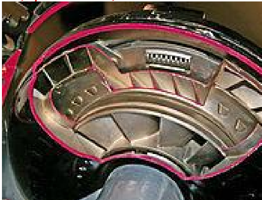
Fig. no. 1