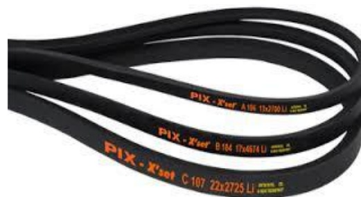
Fig. no. 4