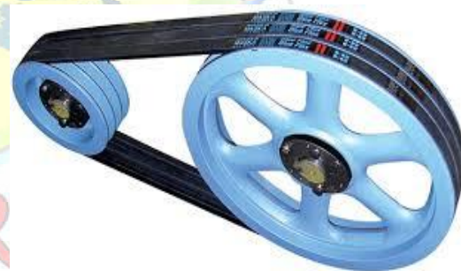
Fig. no. 3

A pulley has a circular crosssection which drives the power from one shaft to another. The diameter of pulley selected according to the need.