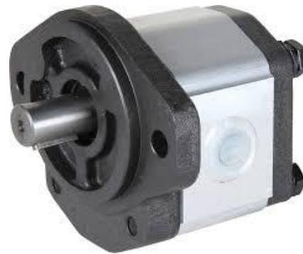
Fig. no. 2

Gear pump is a positive displacement rotary pump that transports fluid using rotating gears. Gear pumps are compact, high pressure pump which provide a steady fluid flow. The gear pump has an efficiency of 90%.