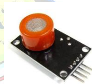
Figure 2 shows MQ7 sensor.

Here the sensing unit consists of MQ7 carbon monoxide sensor which is used to detect the pollutants which come out of vehicles under the concentrations anywhere from 20 to 200ppm and consists of a step down transformer. The step down transformer steps down the voltage and corrects the level of voltage applicable to proceed. This unit is the main area for pollutant detection.