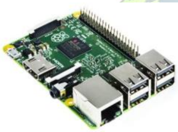
Figure 3 shows IOT device module.

To fulfill the above challenges, organizations normally take the help of enterprise servers.