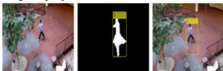
(a) Input Frame (b) Foreground Detection (c) Object Detection

Our proposed hybrid moving object detection has been legalizing by testing with variety of videos. The proposed method has been implemented in Matlab We employ Approximate Median technique with threshold value followed by morphological operations to detect the moving object. In fig 1 (a) represents the input video,(b) represents the foreground detection and finally (c) represents detecting the objects using the proposed method.