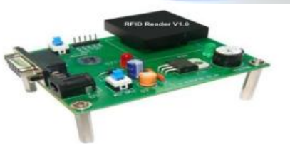
Fig. RFID Tag

A radio-frequency identification system uses tags , or labels attached to the objects to be identified. Two-way radio transmitter-receivers called interrogators or readers send a signal to the tag and read its response.