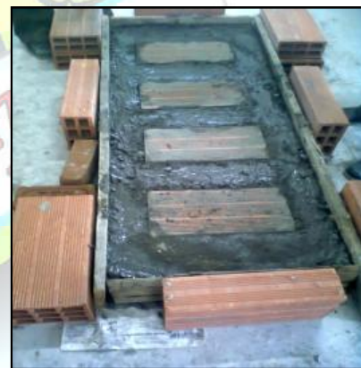
Fig-6 Showing the casting of the Concrete slabs

Here we are using 10mm diameter bar in tension zone. 5 bars in shorter direction and 2 bars in longer direction. Cover of slab is 20mm.