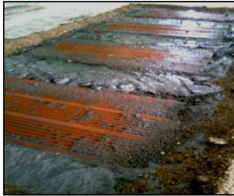
Fig-4 Showing the curing of the slabs