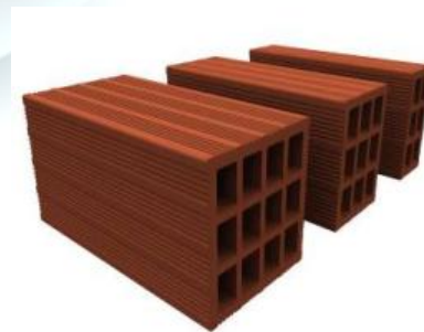
Fig-1 Showing the Porotherm blocks of the different sizes