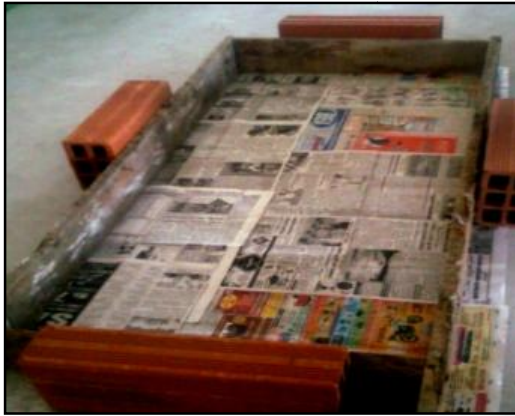
Fig-3 Showing the shuttering placement

Shuttering having the inner size of 1.5m x 0.6m. This is made by wood. Which this support by the brick and a cover of 20 mm.