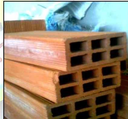
Fig-2 Showing the data Porotherm blocks of the size 400*100*200

Porotherm Brick having the size of 400mm x 200mm x 100mm. This brick is used in slab.