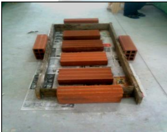
Fig-4 Showing the placement of the porotherm blocks

Shuttering having the inner size of 1.5m x 0.6m. This is made by wood. Which this support by the brick and a cover of 20 mm.