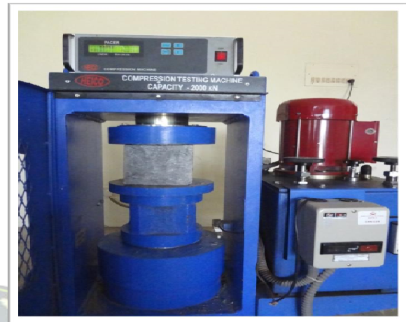
Figure 1 Compression Testing of Cubes

II.9 Tensile strength of cylinder: This test is done to determine the tensile strength of the cylinders. The test is conducted on the 7 th day and the 28 th day and its observation are listed below in the form of a graph. The cylinder is placed in a horizontal position and the load is applied gradually and value is recorded if the cylinder splits into two half or if the cylinder fails while applying the load on it. Tensile strength values with replacement for coarse aggregates by seashell with 10%, 20%, 30% and cement by fly ash with 25%.