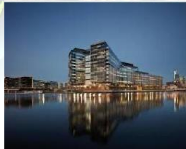
Figure 3.2: Test Images