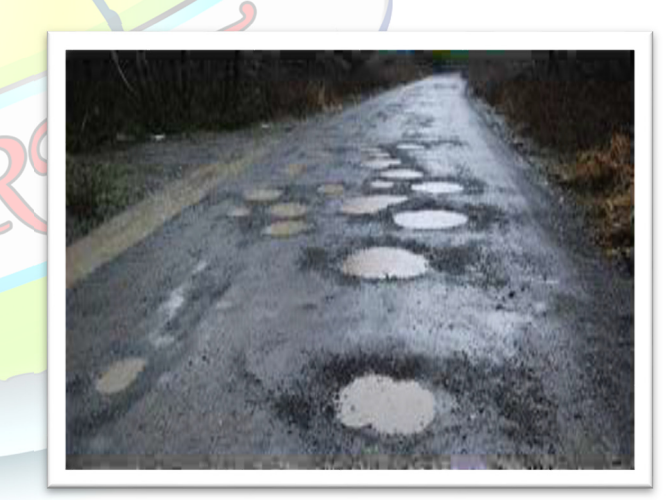
Fig 1.potholes on road

are sometimes hazardous to drivers and pedestrians, and, at the very least, are annoying to drive or bike on. Potholes refer to any type of road surface distress on an asphalt pavement that is more than 150 mm in diameter. Potholes are induced by the combined presence of water in the asphalt soil structure and heavy traffic. Potholes are mostly generated in winter and spring, because water often penetrates the pavement during these seasons. Warnings can be like buzzer if the driver is approaching a pothole, or driver may be warned in advanced regarding what road has how many potholes.